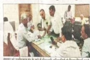
मल्टीपरपज हब के लिए 100 एकड़ जमीन का शुरु हुआ चिह्नांकन... मल्टीपरपज हब के लिए 100 एकड़ जमीन का शुरु हुआ चिह्नांकन...